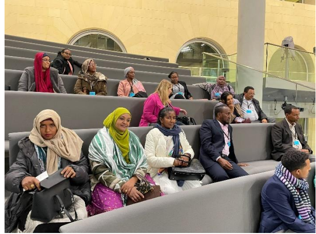
Impressions of the meeting in the German Parliament, 7 th November 2022