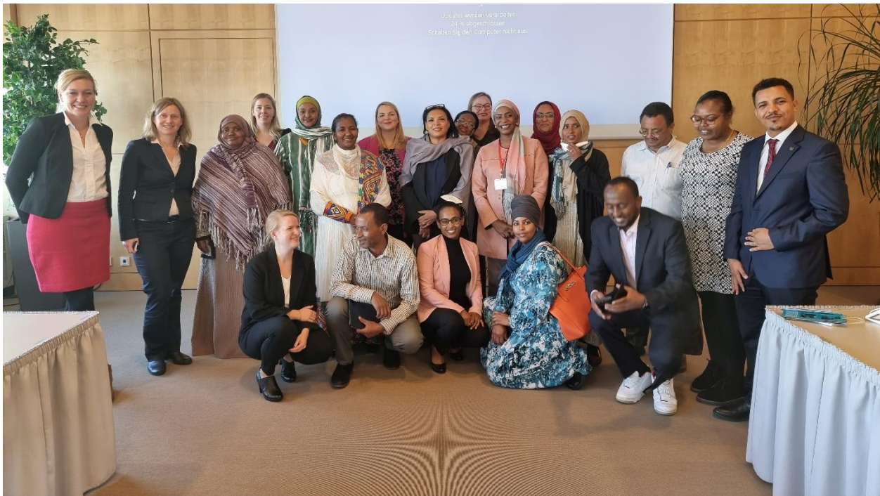
Exchange Visit in the Federal Ministry for Economic Cooperation and Development, 7 th November 2022

The representatives from BMZ were committed to listening to the experiences shared by the delegation. During the round of introduction, several topics were discussed, for example the issue of social security for pregnant women and breastfeeding mothers, the challenge in politically volatile contexts to still be able to address gender-based violence (GBV) and female genital mutilation (FGM) and provide basic health services, especially to pregnant women and during birth, but also the question about possibilities to achieve the envisioned social norm change in view of prevailing harmful traditional practices.