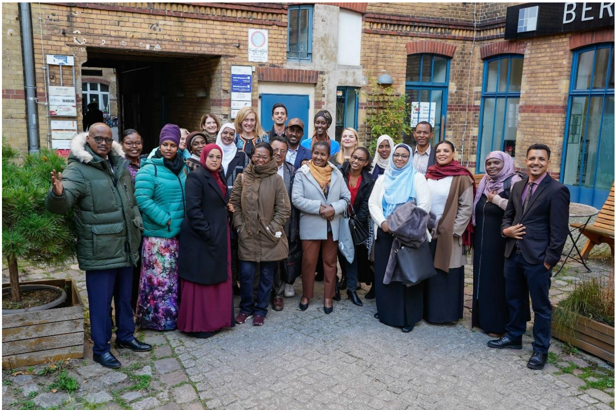
Delegation in Berlin at Weibervirtschaft

November 5 th to 12 th , 2022 Germany, Berlin and Frankfurt