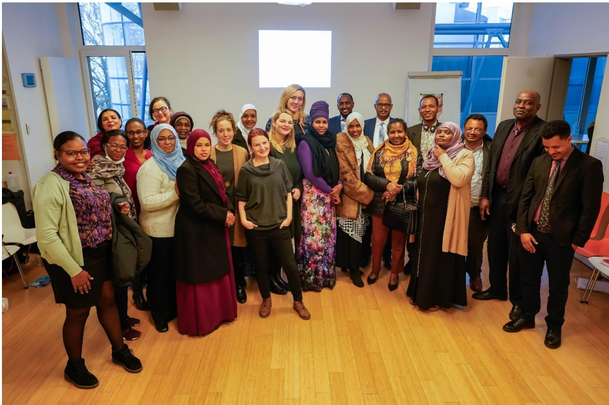
Delegation visiting the Berlin Coordination Office against FGM/C, 8 th November 2022