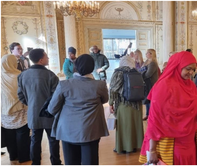
Exchange with the representatives of the State Parliament of Hessen and visit of the historic building, 10 th November 2022