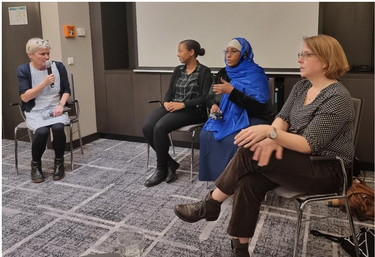
Exchange with the representatives from FIM, 10 th November 2022